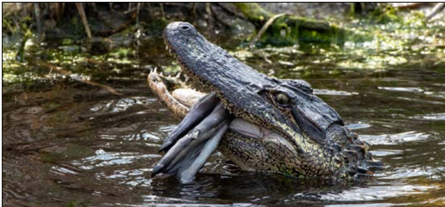
Huntington Beach State Park - Murrelets Inlet, S.C.