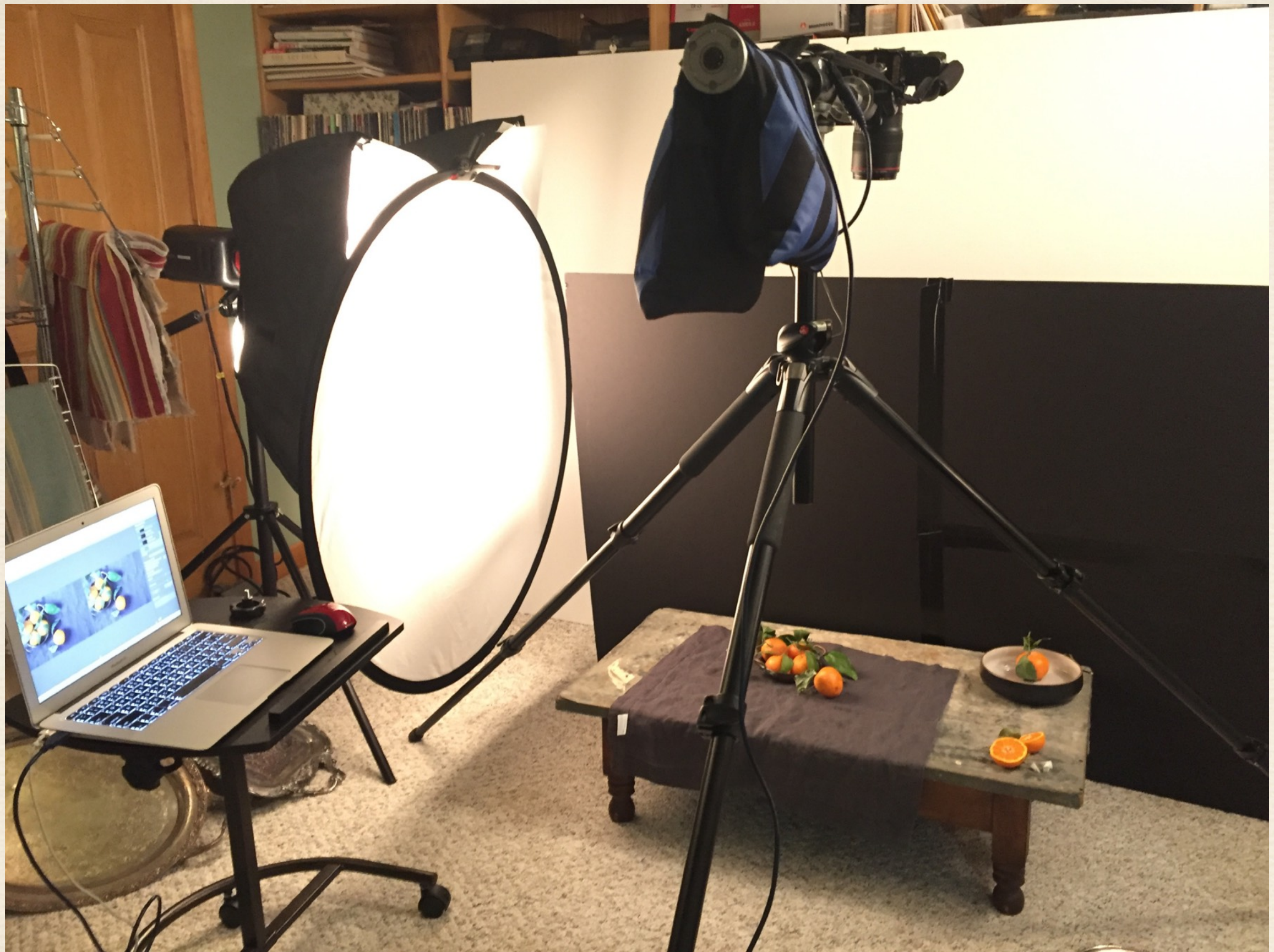
Sue Augustine “Typical Set up”