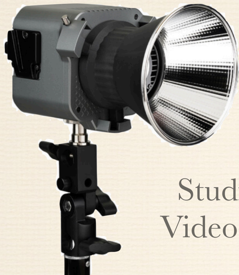
Studio or Video Light