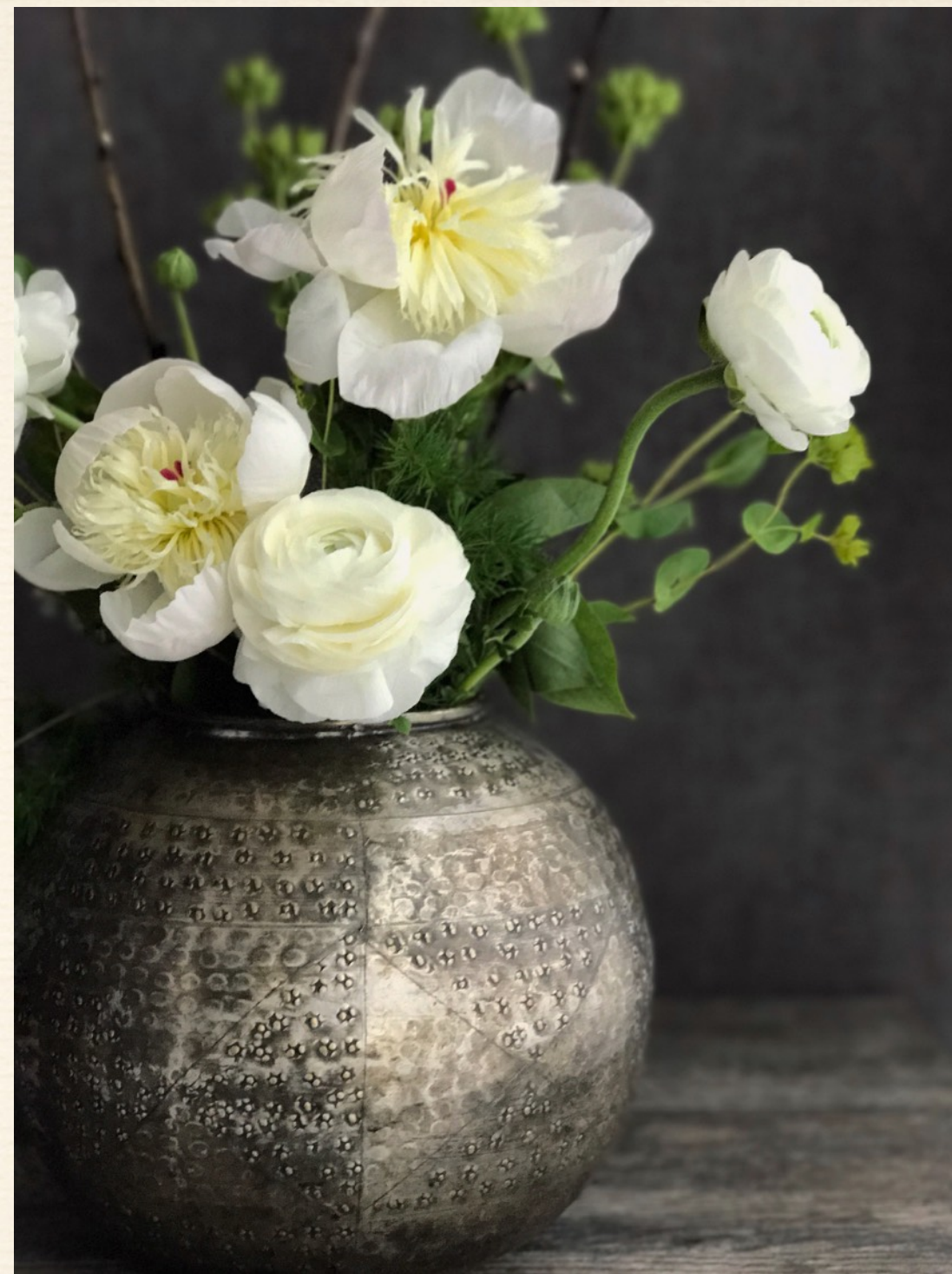
Sue Augustine Natural Light Set up in dinning room, next to slider