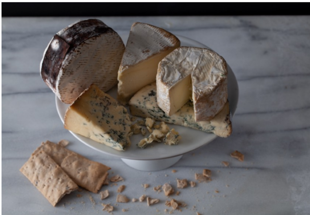
Sue Augustine Early shot before getting lighting & composition they way she wanted