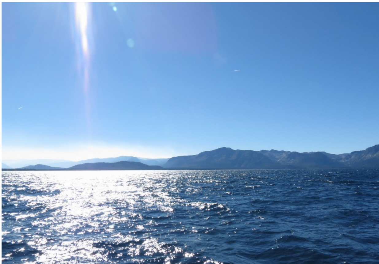
Canon Powershot SX40 f/8 - 1/2500